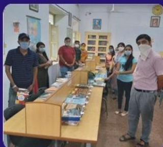
Book-Bank Facility for needy students