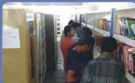
Open Shelf System