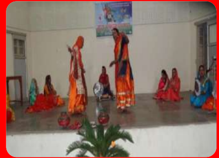
Celebration of Teej by Ladies Teacher & Girls Students