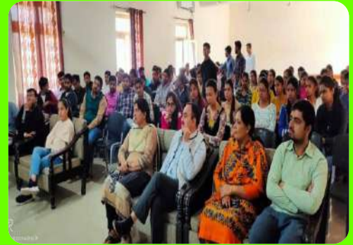
PPT Presentation Competition of B.Com. Final year students