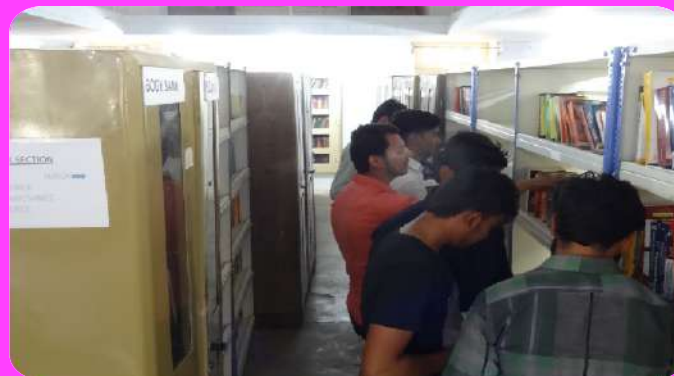
Open Shelf System