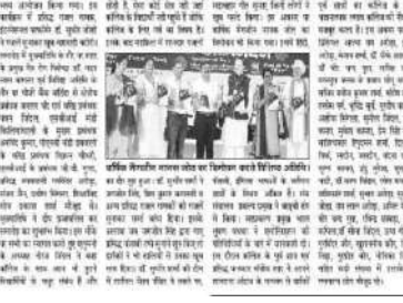
एलसीएसटी एमएल 'शम-ए-गज़ल' समारोह आयोजित।