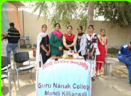
Services rendered by Red Cross Society