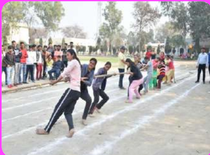
Tug of War (Girls)