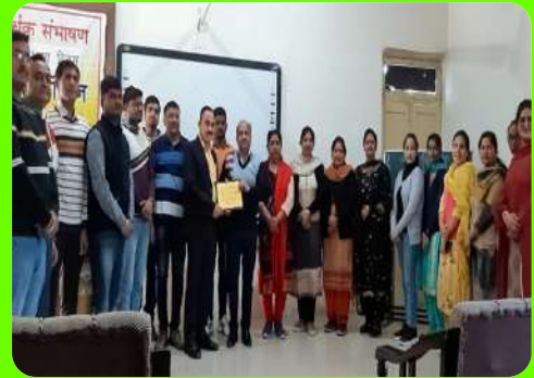
Celebration of International Mother Language Day by IQAC