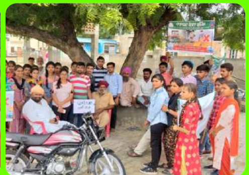
Awareness Campaign in Villages on Stubble burning