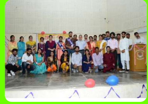
Freshers' Party of Department of Arts