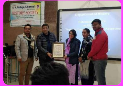
Extension lecture by Department of History