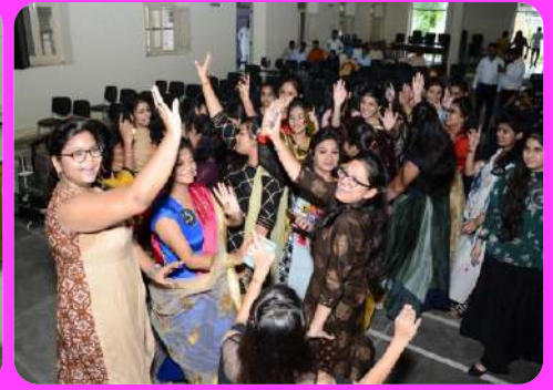
Freshers' Party of Department of Business Management & Commerce