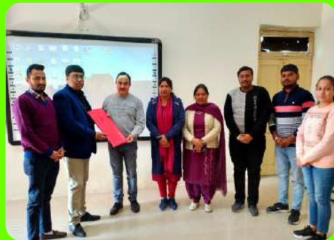
Extension lecture on GST by Deptt. of Business Management & Commerce