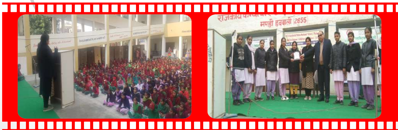
Motivational Lecture in Govt. Girls. Sen. Sec. School, Mandi Dabwali

In case of absence in any paper, a fine of Rs.100/- will be charged. A student having less than 75% lectures will not be allowed to appear in university examinations.