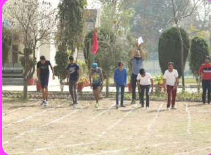
Ready Steady Go 100 M Race