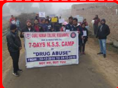
Awareness Rally on "DRUG ABUSE" in village Fatuhiwala