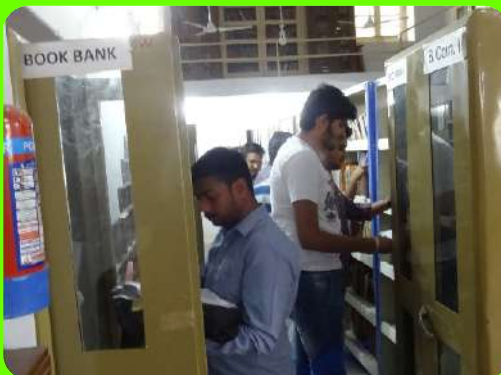
Book-Bank Facility for needy students