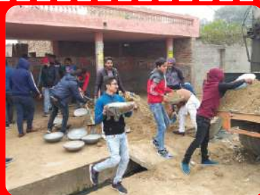
Cleanliness drive by NSS Volunteers