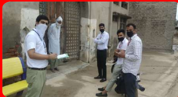
COVID-19 Awareness survey in surrounding villages

Best Volunteer (Girls) M.A. (Hindi) Final Year