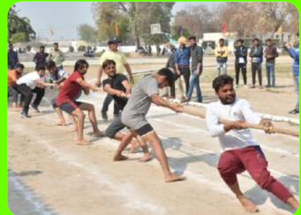
Tug of War (Boys)