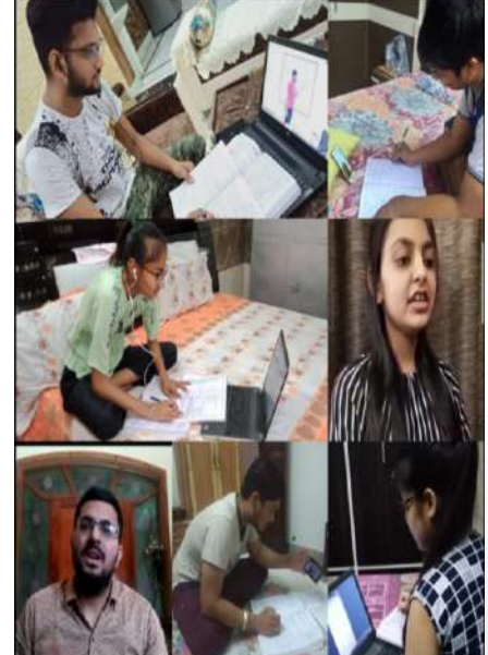
Online Learning during COVID-19 Lockdown Period