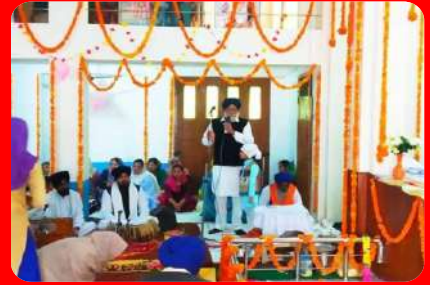
550th Gurburab Celebration Shri Guru Nanak Dev Ji on 12-11-2019