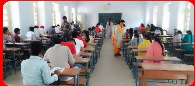
Quiz organized by Department of Punjabi