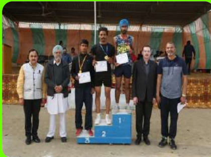
Winners with their Medals & Certificates