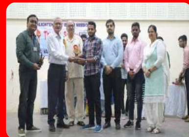
Annual Function of Thinkers' Society and Celebration of National Unity Day