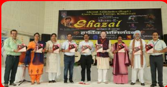
Release of College Magazine "NANAK JOT"

"Nanak Jot" a college magazine is published regularly in which students take part enthusiastically by their creativity . An annual report of college achievements is also reflected in college magazine along with the pictures. It is a medium for the students to exhibit their feelings and expressions.