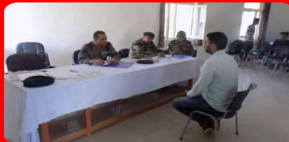
Enrollment of New N.C.C. Cadets