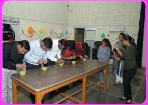
Teachers' Day Celebration by Deptt. of Business Management & Commerce