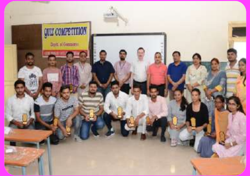
Business Quiz conducted by Deptt. of Business Management & Commerce