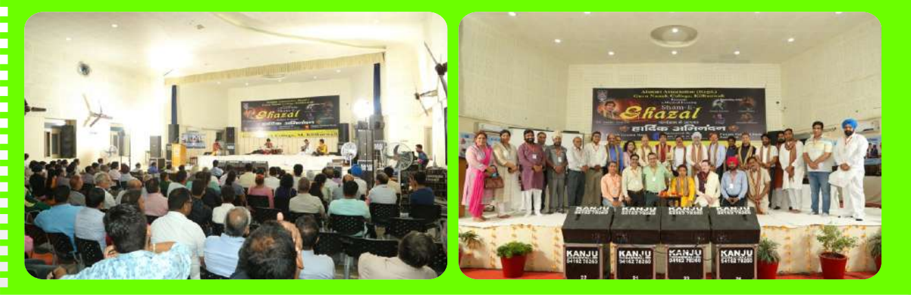
Ghazals of Ustad enjoyed by the Audience