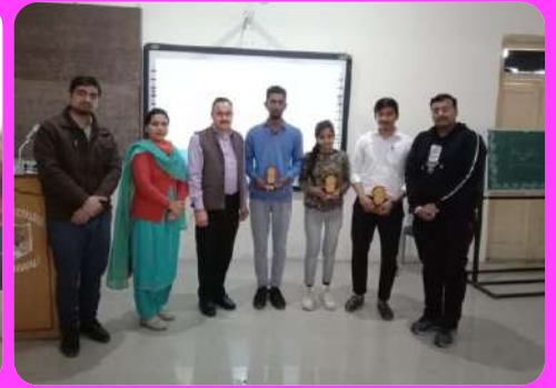
Paper Reading Competition by Economics Department