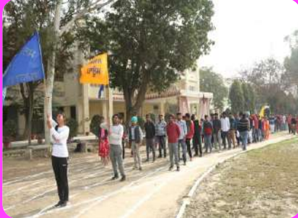
Flag bearers of Different Houses