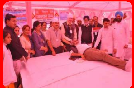
Blood Donation Camp on the eve of Gurburab by Alumni Association in Collaboration with Red Cross Society on 12-11-2019