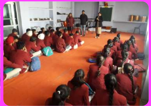
Career Guidance to School Students by Deptt. of Business Management & Commerce