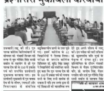
डबवाली (एच.टी.सी.) गुरु नानक कॉलेज में प्रश्नोत्तरी मुकाबला करवाया।