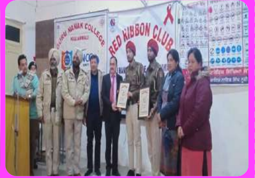
Extension lecture on " Drug Abuse and Traffic Rules Awareness" by Red Ribbon Club and N.C.C.